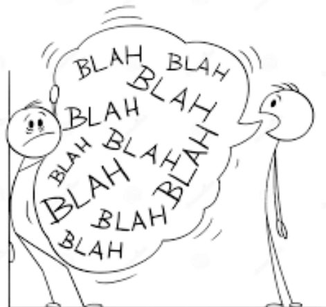
Taming the Tongue James 3:1-12